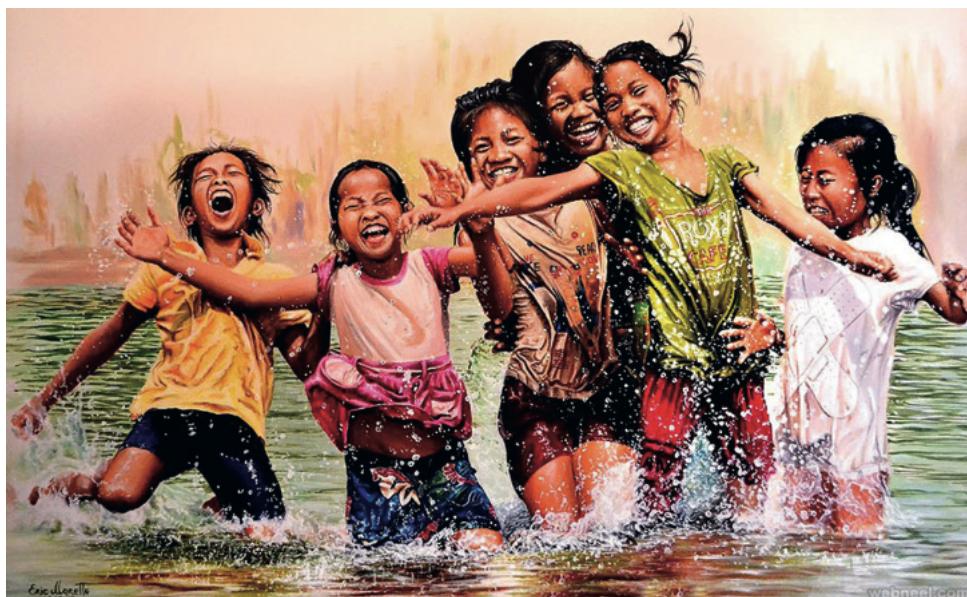
Kids Happy Acrylic Painting Eric Marette

Look at the following image and answer the question below using the PEEL structure: